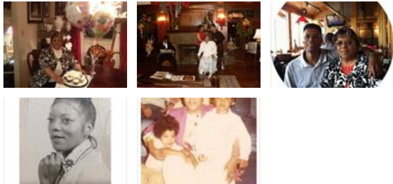
Kimberly - April 12, 2021 at 07:01 PM

“ 14 files added to the album Memories Album