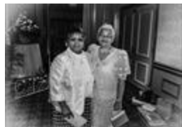
Raymond Harris - April 12, 2021 at 05:30 PM

“ 1 file added to the album Memories Album